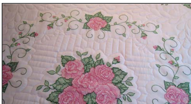
Detail from the queen-size quilt to be raffled between August and December 2007. All embroidery and quilting has been done by hand. Proceeds to benefit KDH.

If you haven't encountered a Tag Day volunteer, you can still contribute by dropping by the Gift Shop and donating. Every bit helps!