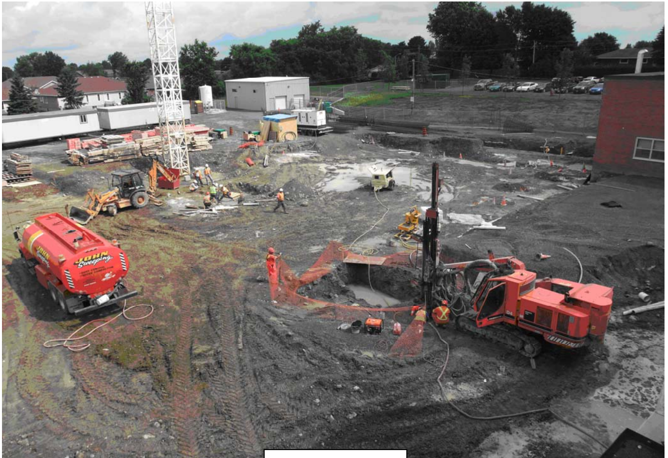
Issue 3: July 2009

Construction of the $23 million addition for a new Emergency Department, Diagnostic Imaging Department and three new Surgical Suites is in full swing. There are construction workers working hard despite the heat, heavy machinery and trucks can be found throughout the construction area, and the crane hovers high above all of the action.