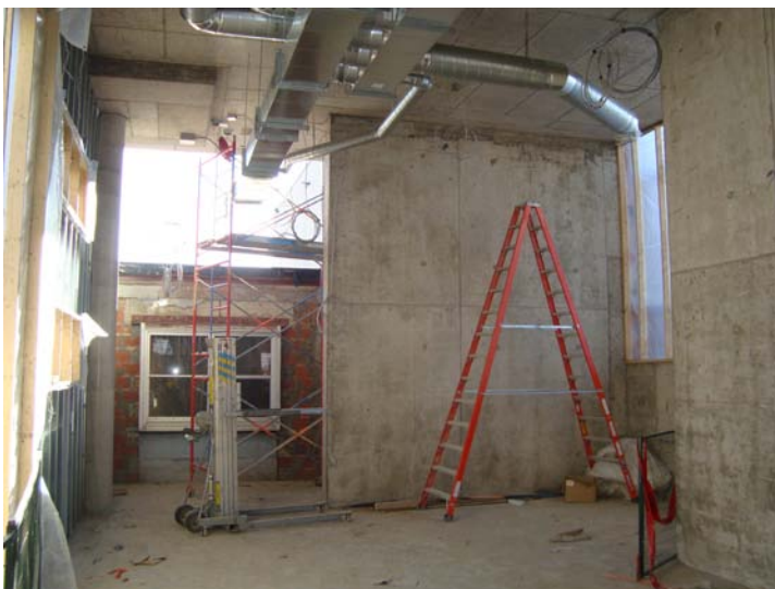
Level 2 corridor – Jan/10