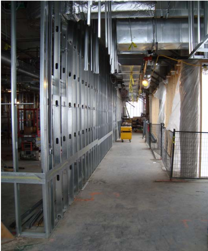
Main corridor looking onto the courtyard Jan/10