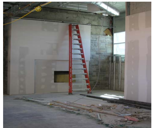
Level 2 corridor and fireplace –Mar/10 (between Surgical Care Unit and the existing building)