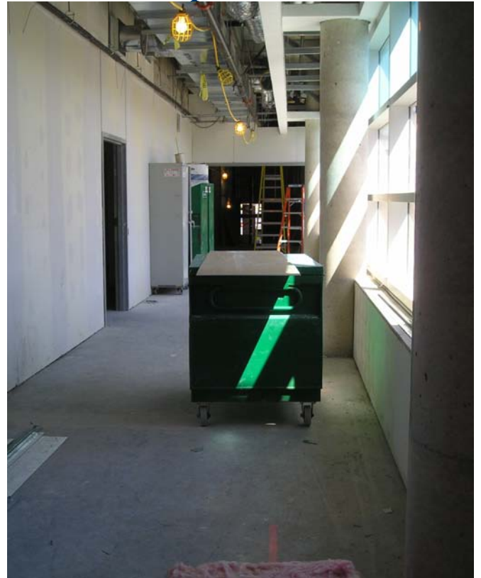
Main corridor looking onto the courtyard Apr/10