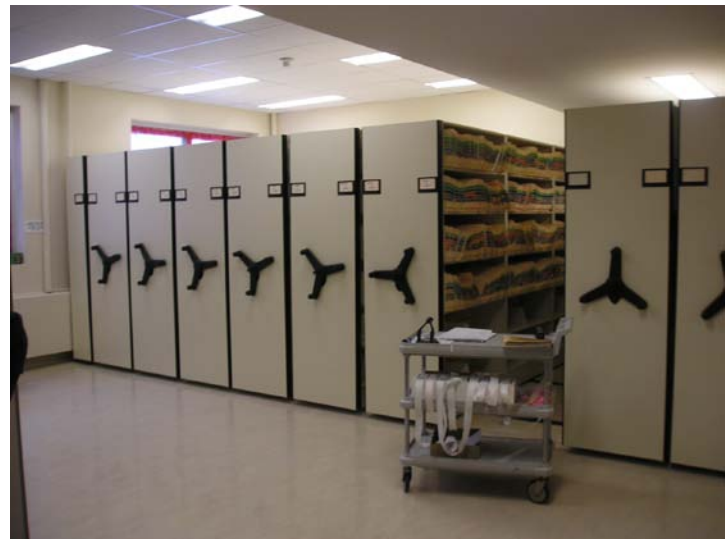
Temporary home for medical records