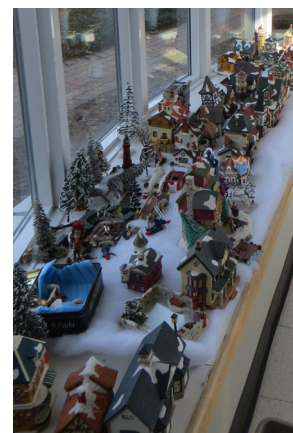
Christmas Village, set up by Ric and Bev Cecchini