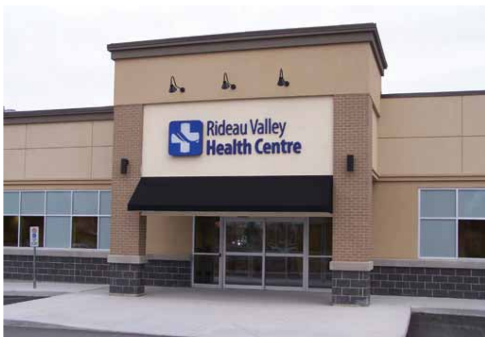
Rideau Valley Health Centre, 1221 Greenbank Road, Ottawa.

“Urgent care centres are cost-effective to operate, offer shorter wait times, and take the pressure off crowded hospital ERs.”