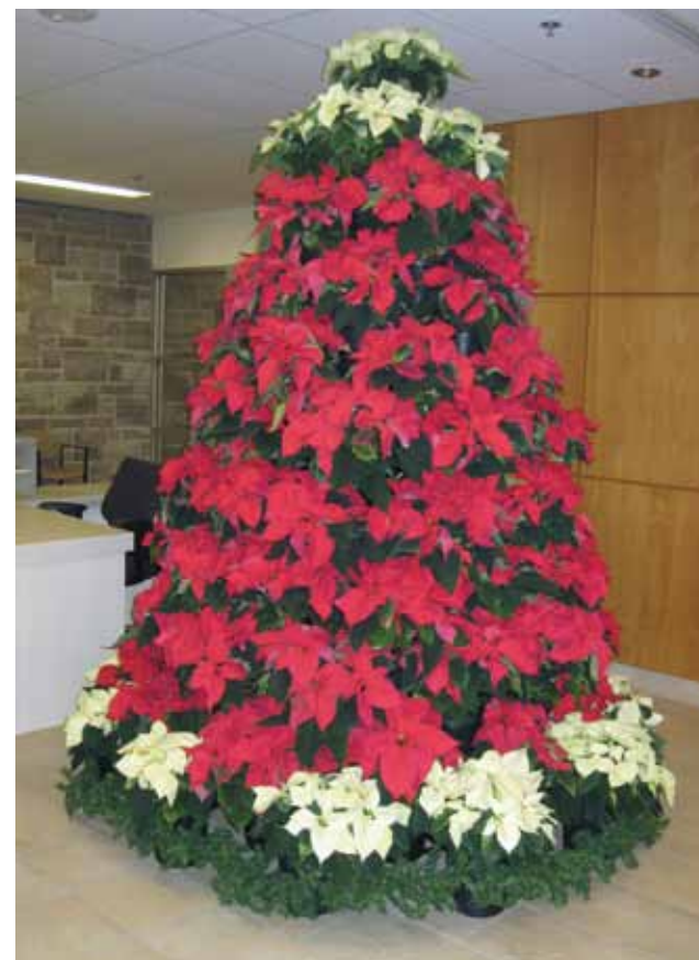
A beautiful poinsettia tree in the KDH main lobby, donated by HMS Tropical Plants of Kemptville