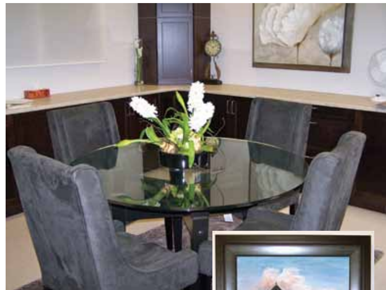
The new KDH Auxiliary Volunteer Room

“The Auxiliary plays a crucial dual role in support of KDH: both fundraising for essential medical equipment, and providing volunteers for every area of the hospital.”