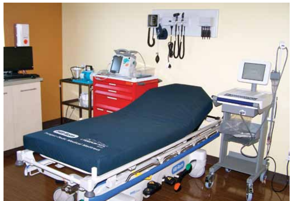
The Urgent Care Centre's trauma room.