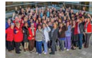
Group photo taken November 8th includes KDH staff, administration, physicians, volunteers, Foundation staff and more.