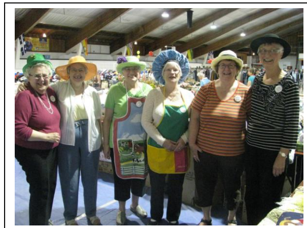
The Acton's Corners ladies manning the linen table distinguished themselves with their lovely headwear!