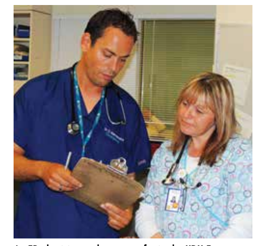
An ER physician and nurse confer in the KDH Emergency Department

The new process has proven to be very beneficial, as ER physicians are able to make care decisions with more information at hand. This information is particularly helpful in an emergency situation and helps to inform the care plan moving forward.